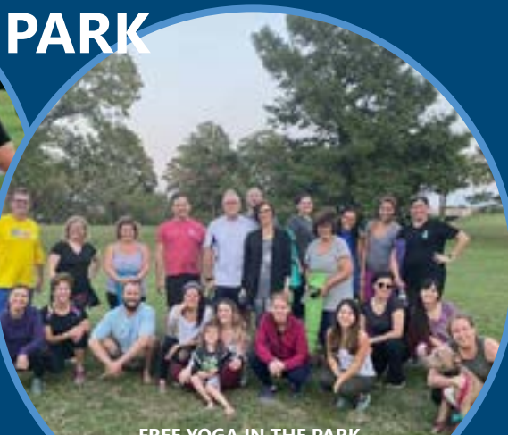
FREE YOGA IN THE PARK CLASSES ARE HELD BIWEEKLY APRIL THROUGH OCTOBER