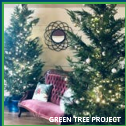
GREEN TREE PROJECT