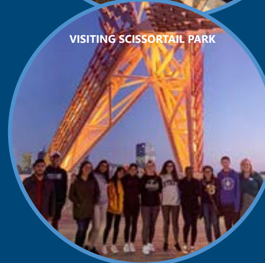
VISITING SCISSORTAIL PARK