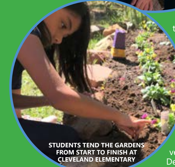
STUDENTS TEND THE GARDENS FROM START TO FINISH AT CLEVELAND ELEMENTARY