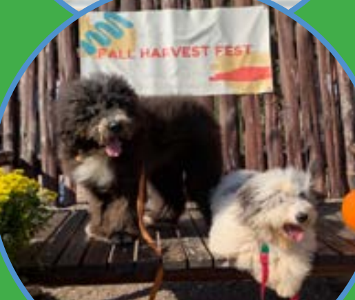
FURRY FRIENDS ARE WELCOME!