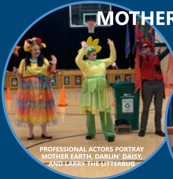
PROFESSIONAL ACTORS PORTRAY MOTHER EARTH, DARLIN' DAISY, AND LARRY THE LITTERBUG