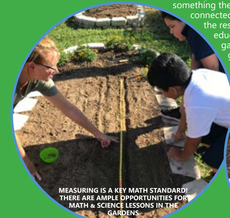
MEASURING IS A KEY MATH STANDARD! THERE ARE AMPLE OPPORTUNITIES FOR MATH & SCIENCE LESSONS IN THE GARDENS

The pilot program is a quarter underway, and already the results are compelling. One teacher says of the garden program: "It makes them so happy to see that something they planted can provide food for everyone. They become connected to our community. It is an experience they will remember the rest of their lives." OKC Beautiful's goal is to fund garden educators for each of the schools where they operate a garden. Please consider supporting OKC Beautiful's garden educator program.