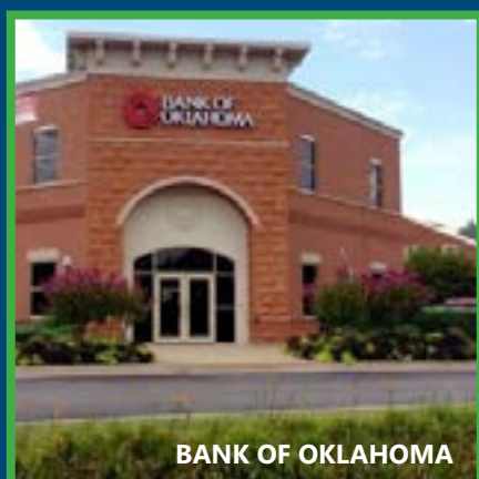
BANK OF OKLAHOMA