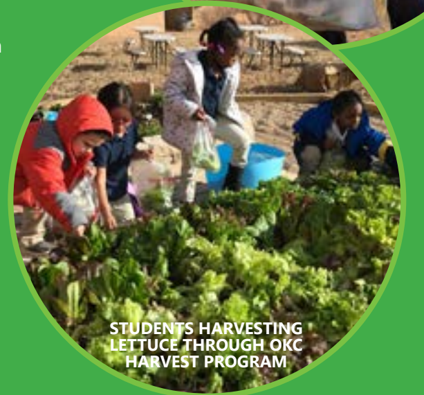
STUDENTS HARVESTING LETTUCE THROUGH OKC HARVEST PROGRAM