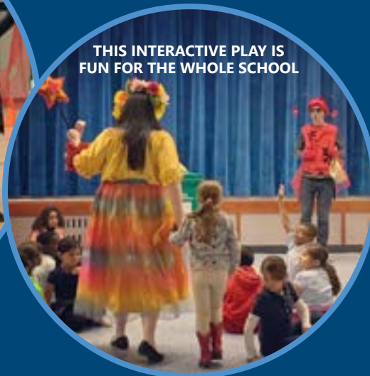
THIS INTERACTIVE PLAY IS FUN FOR THE WHOLE SCHOOL