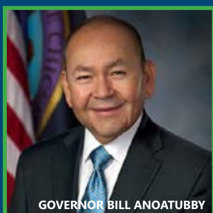
GOVERNOR BILL ANOATUBBY