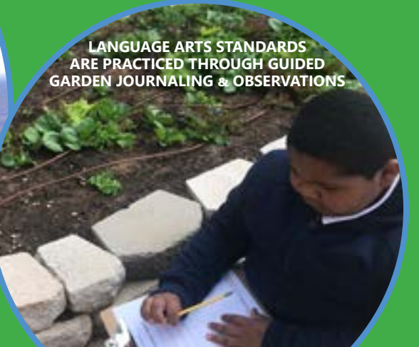
LANGUAGE ARTS STANDARDS ARE PRACTICED THROUGH GUIDED GARDEN JOURNALING & OBSERVATIONS