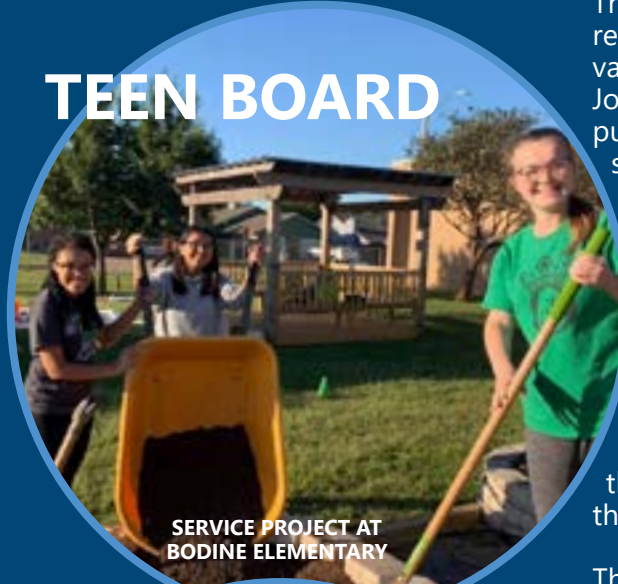
SERVICE PROJECT AT BODINE ELEMENTARY