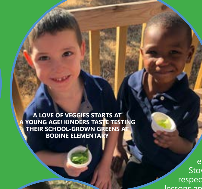
A LOVE OF VEGGIES STARTS AT A YOUNG AGE! KINDERS TASTE TESTING THEIR SCHOOL-GROWN GREENS AT BODINE ELEMENTARY