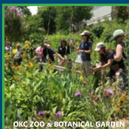
OKC ZOO & BOTANICAL GARDEN