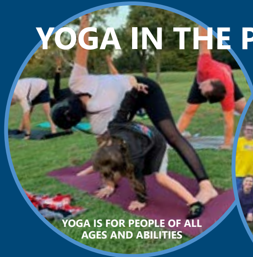
YOGA IS FOR PEOPLE OF ALL AGES AND ABILITIES